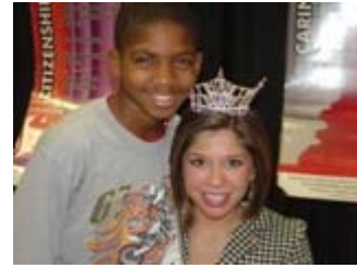
Miss Delaware celebrates SOR